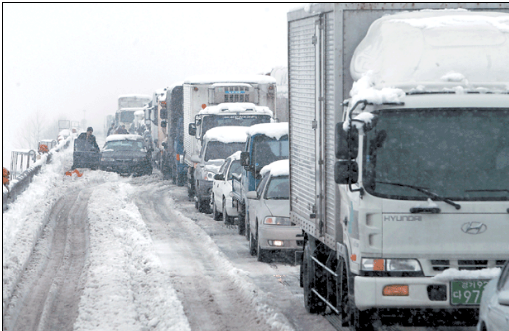
Vehicles stand bumper to bumper for hours yesterday on an expressway in Cheongwon, North Chungcheong Province, when record levels of spring snow fell in the central region.

An estimated 27.6 billion won worth of property damage was reported.